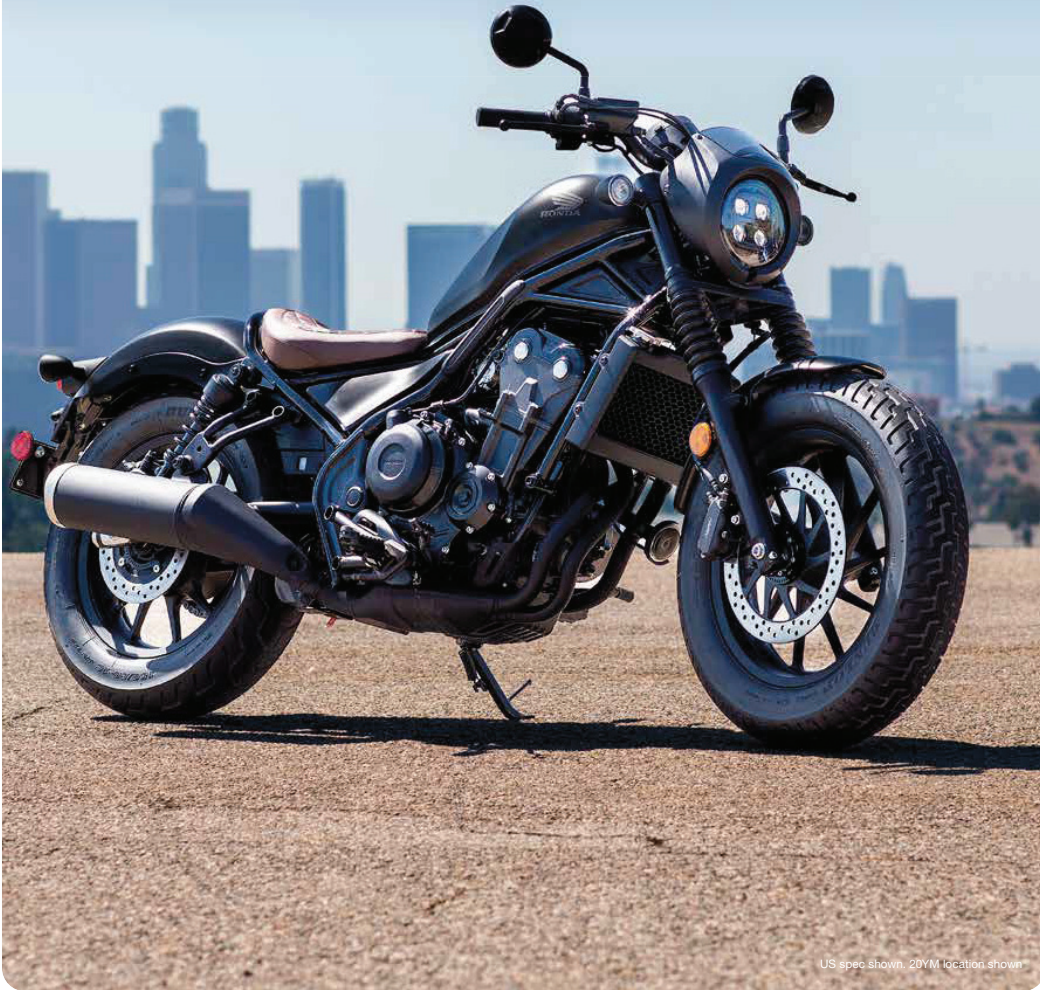
US spec shown. 20VM location shown