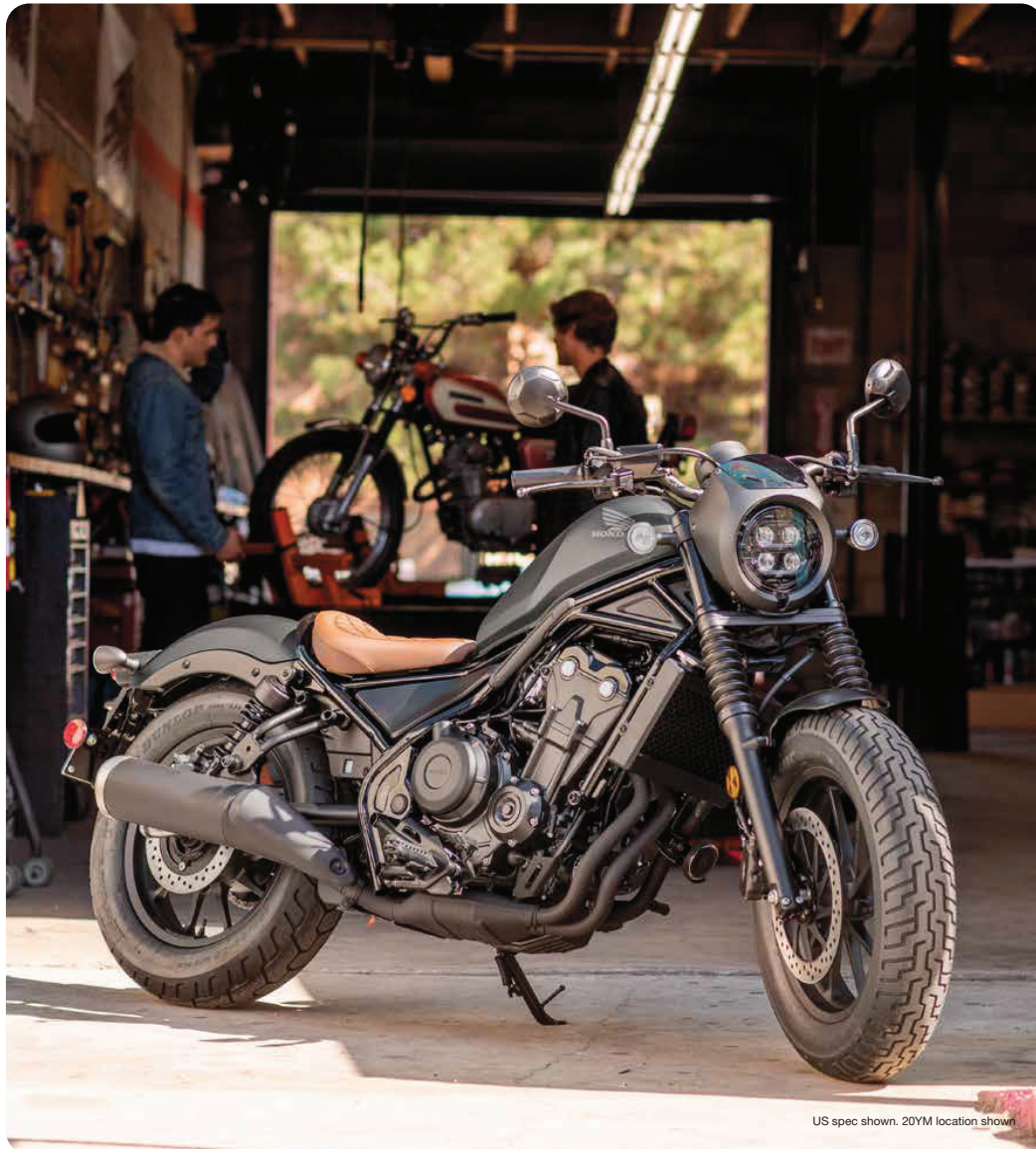
US spec shown. 20YM location shown